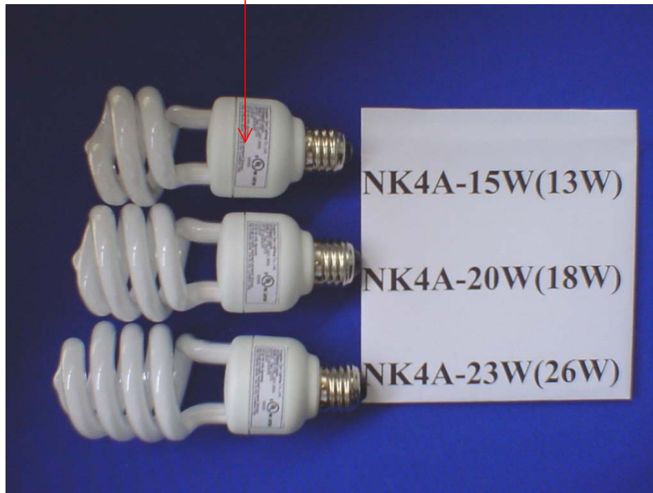
Figure 3 M/N: QSM, NK4A Series General Appearance and Label Location