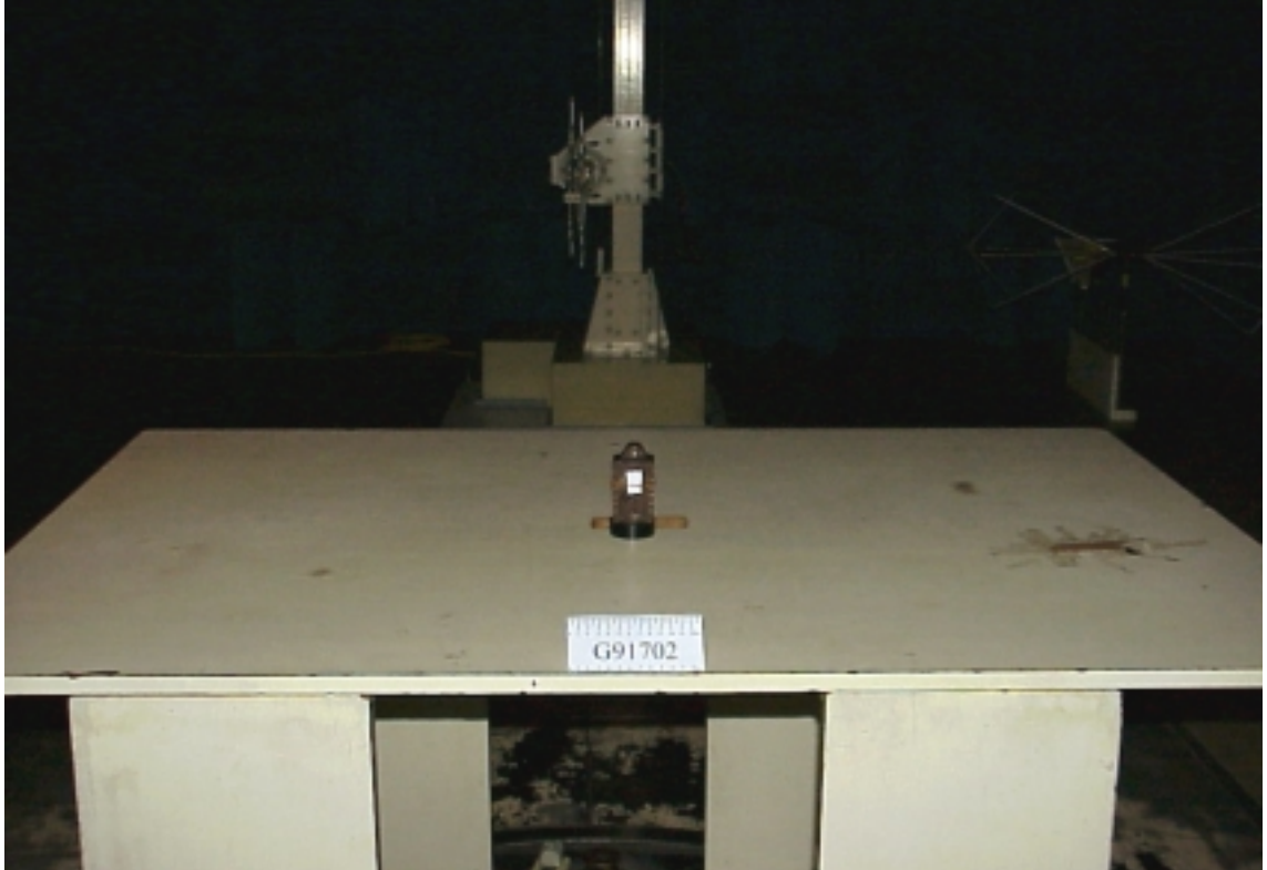
EUT on Side