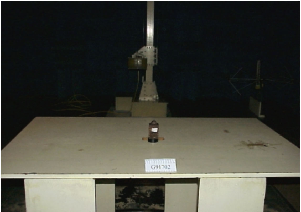
EUT on Stand