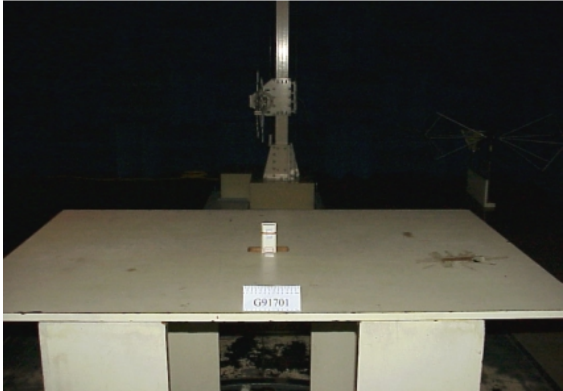
EUT on Side