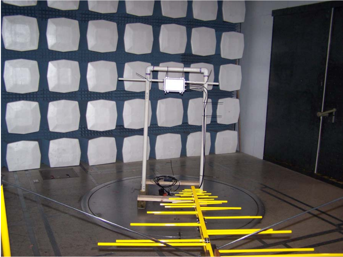
Photograph 4: Radiated Emissions Test Setup