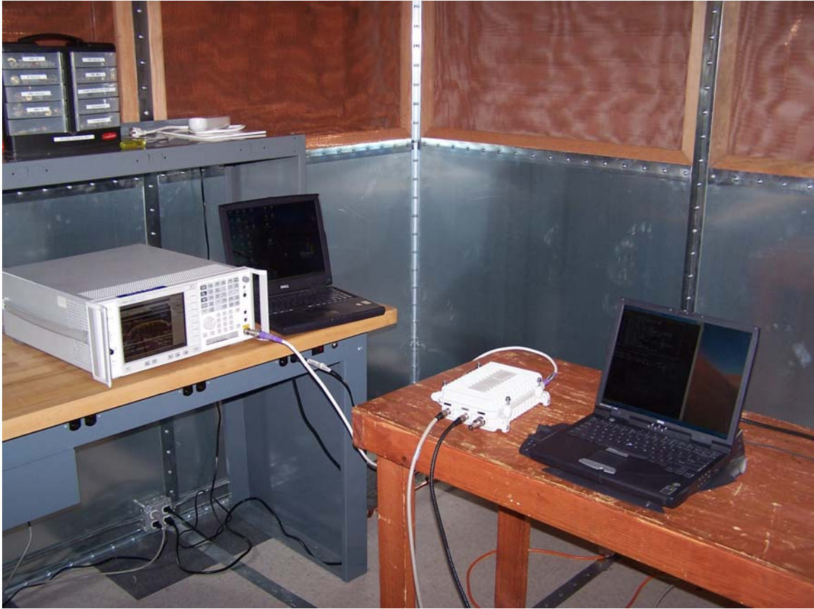
Photograph 1: Conducted Power Test Setup