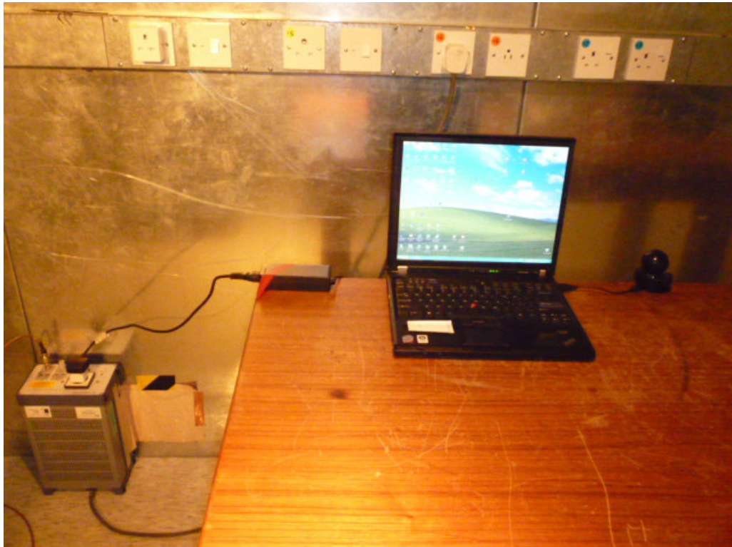
Set-up for AC wireline conducted emissions