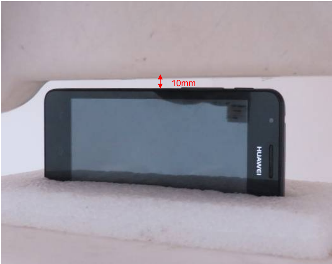
Picture 15: Left Edge, the distance from handset to the bottom of the Phantom is 10mm