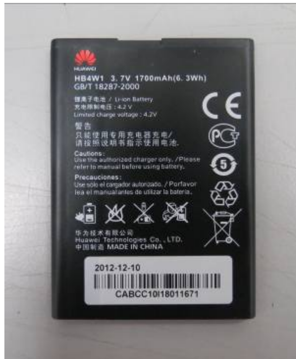
b-3: Battery 3