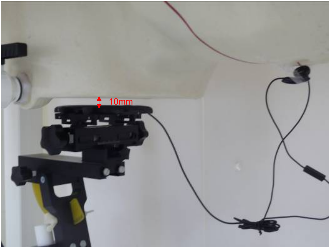
Picture 19: Back Side with earphone, the distance from handset to the bottom of the Phantom is 10mm