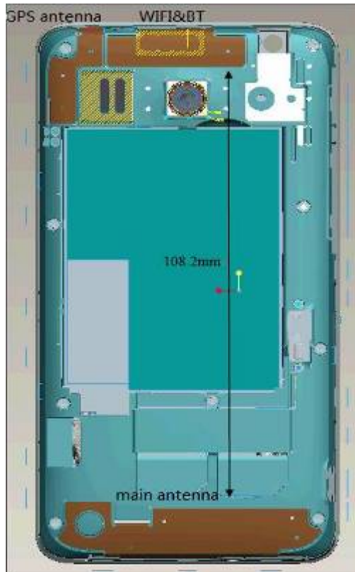
b: Back View