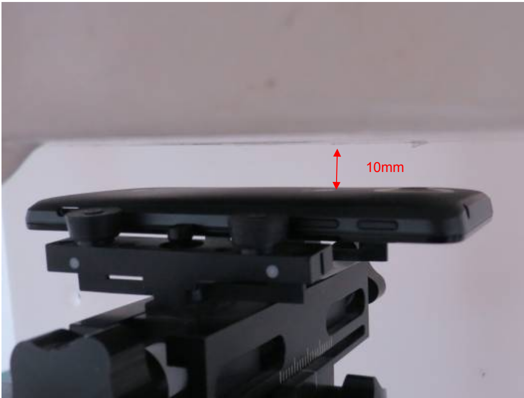
Picture 13: Back Side, the distance from handset to the bottom of the Phantom is 10mm