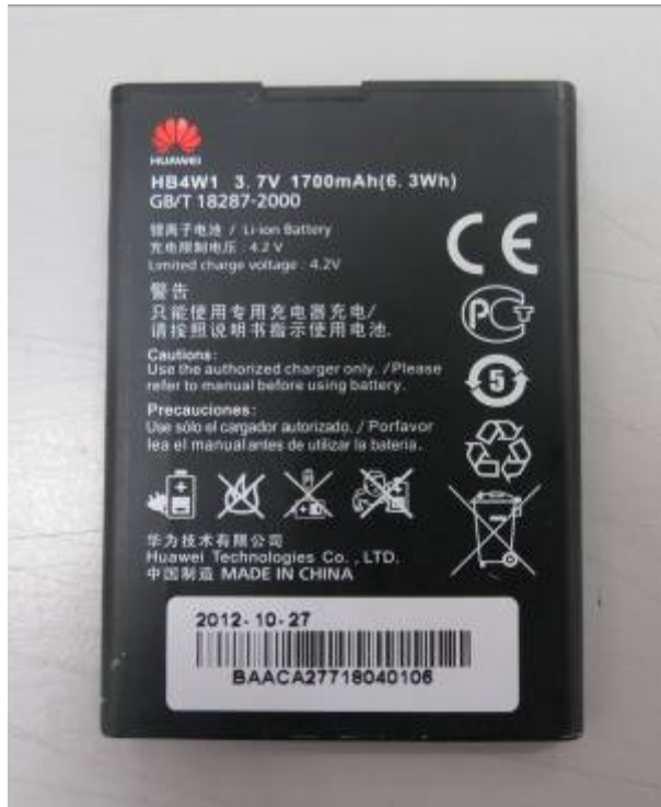
b-1: Battery 1