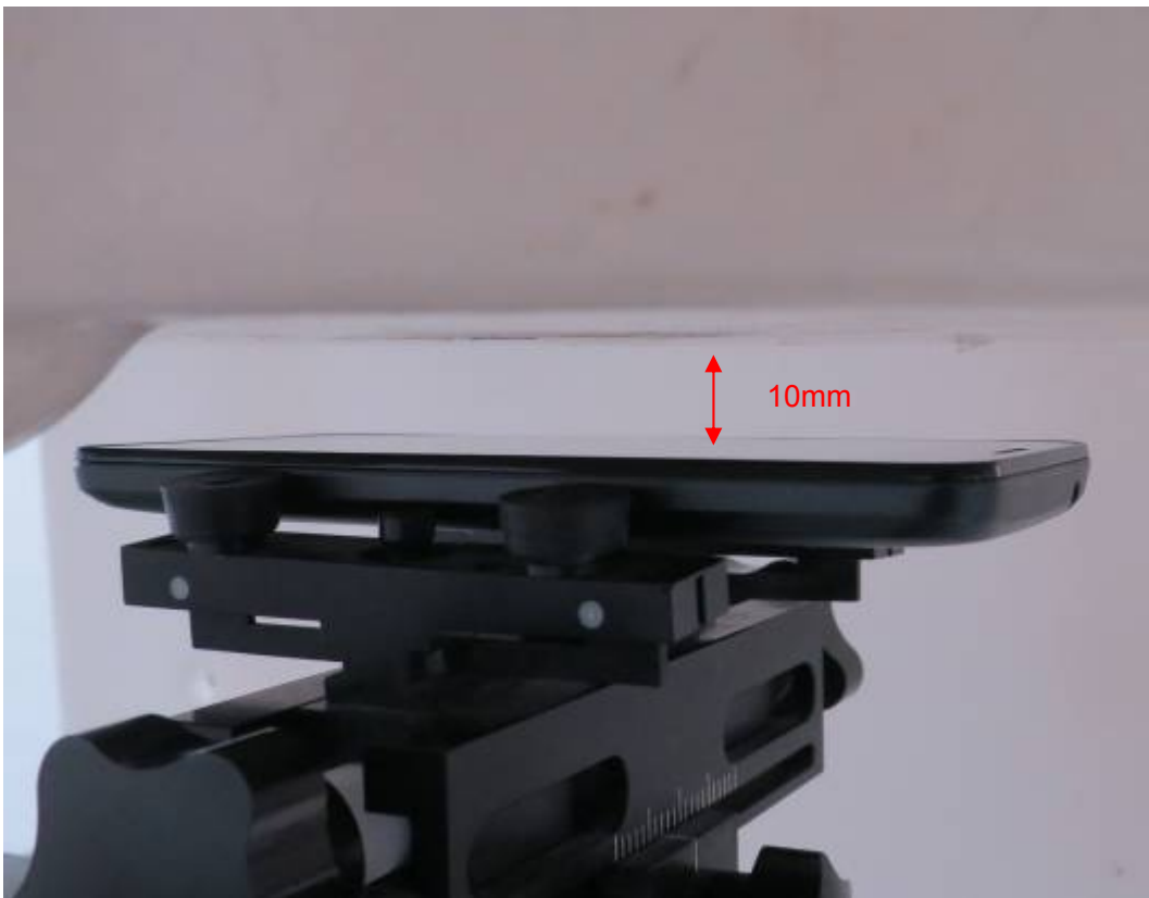
Picture 14: Front Side, the distance from handset to the bottom of the Phantom is 10mm