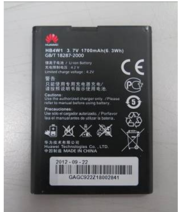
b-2: Battery 2