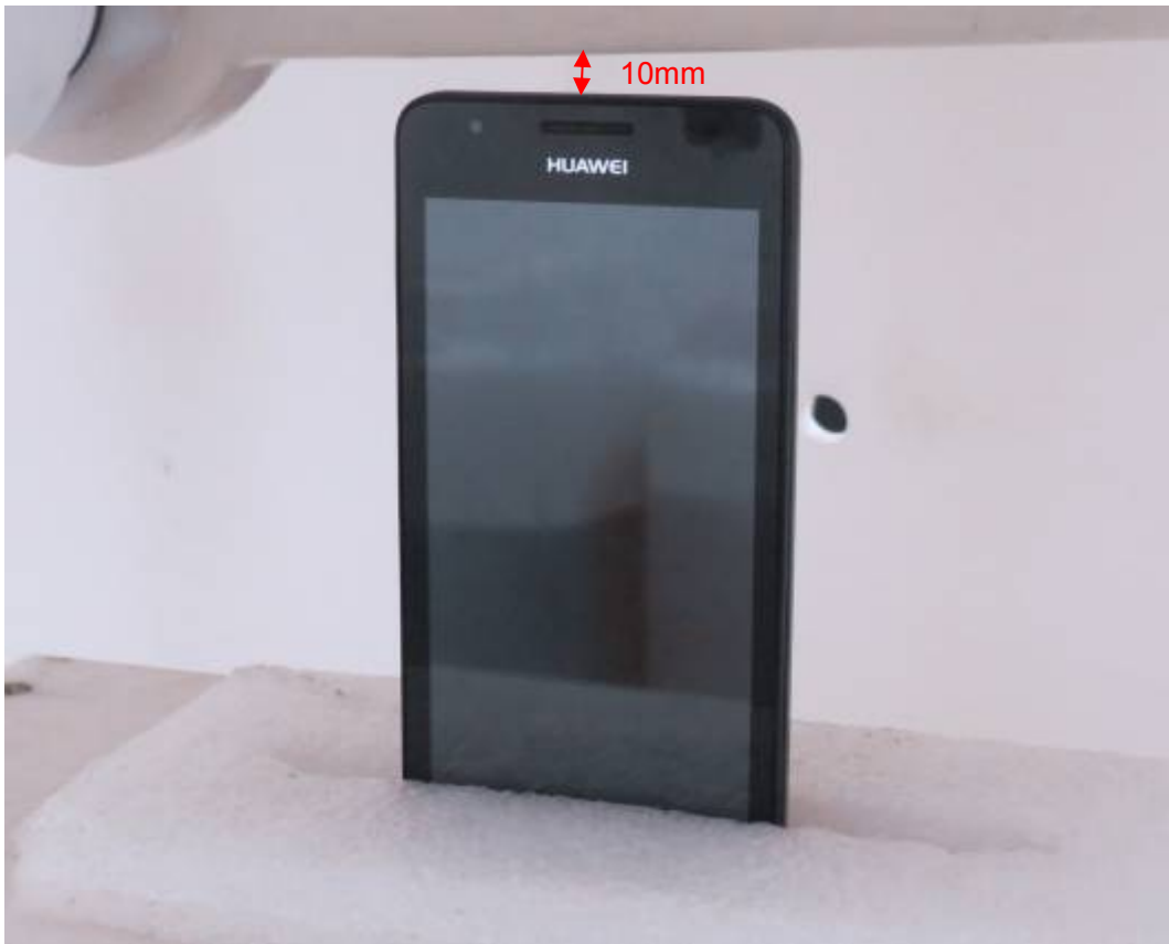
Picture 17: Top Edge, the distance from handset to the bottom of the Phantom is 10mm