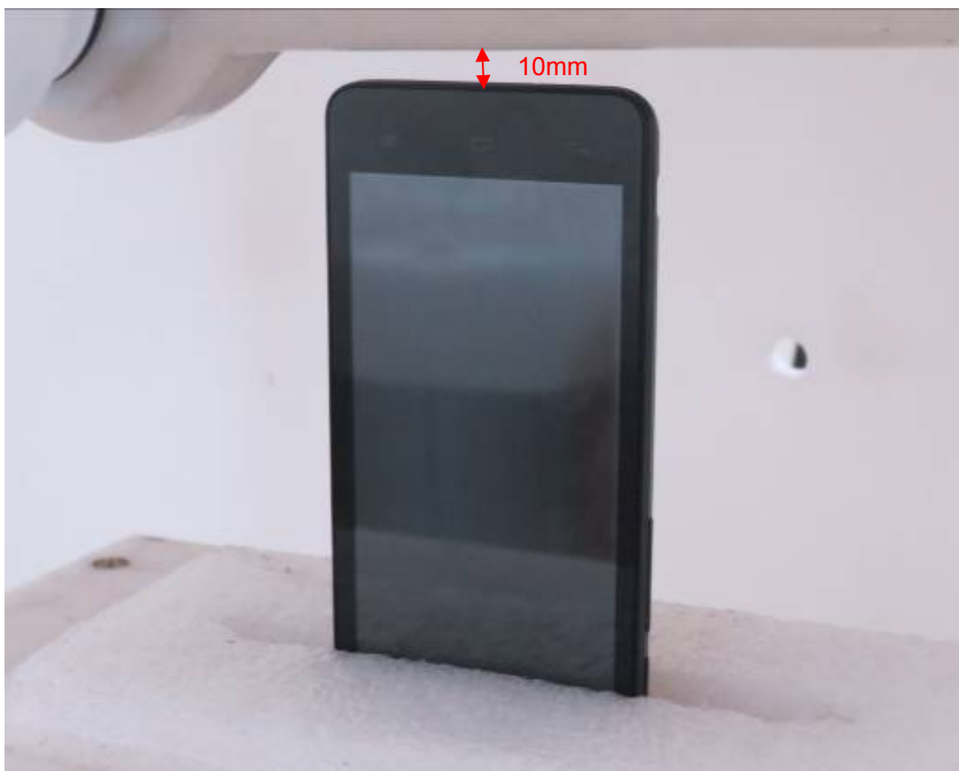
Picture 18: Bottom Edge, the distance from handset to the bottom of the Phantom is 10mm