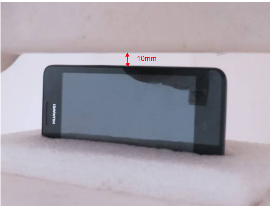
Picture 16: Right Edge, the distance from handset to the bottom of the Phantom is 10mm