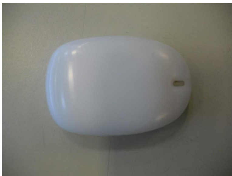
Figure 2 – Top side of EUT