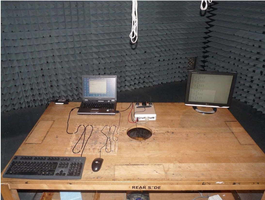
Photo 3: Test setup for radiated measurements (computer peripheral setup, EUT supplied by Serial-cable from computer, unintentional radiator §15)