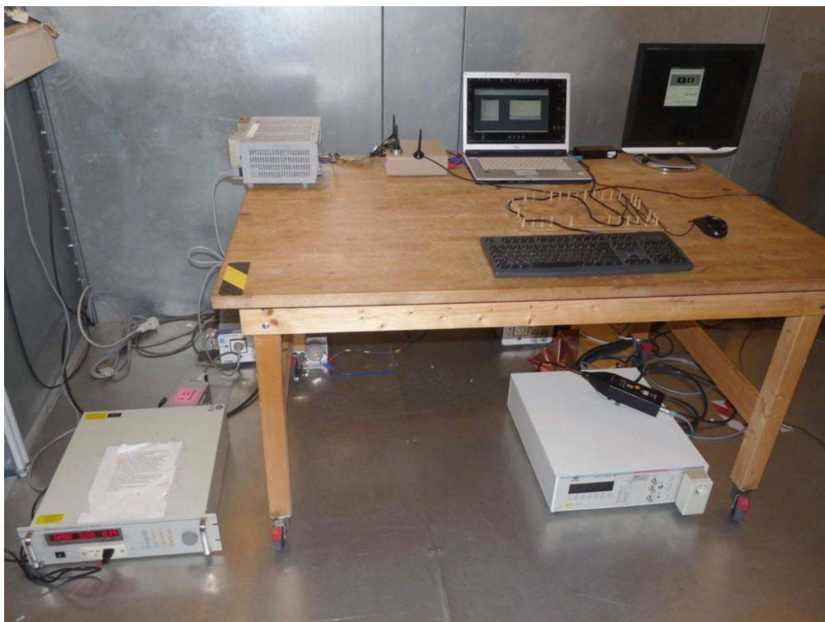
Photo 1: Test setup for conducted measurements (AC Port (power line), EUT supplied by AC/DC Power Supply, intentional / unintentional radiator §15)