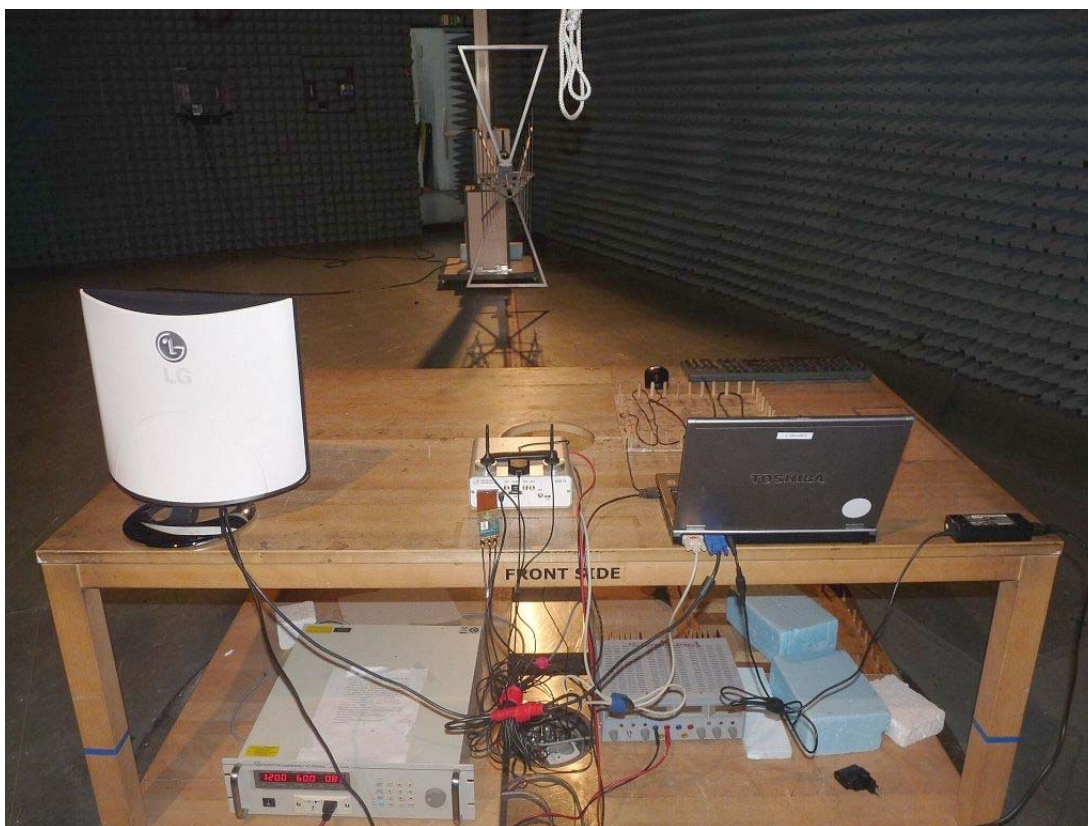
Photo 4: Test setup for radiated measurements (computer peripheral setup, EUT supplied by Serial-cable from computer, unintentional radiator §15)