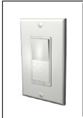
Shown with user supplied Decora™ trim plate