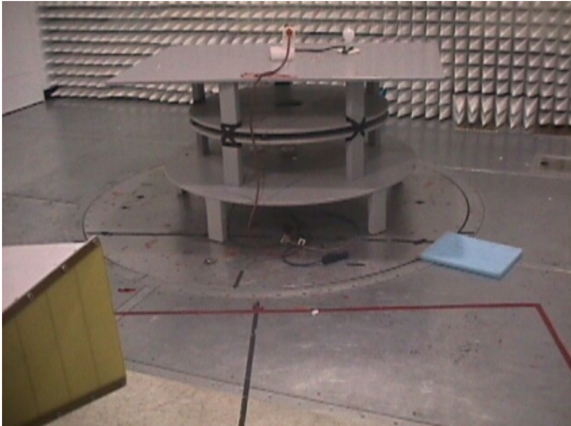
Radiated Emissions Test Configuration