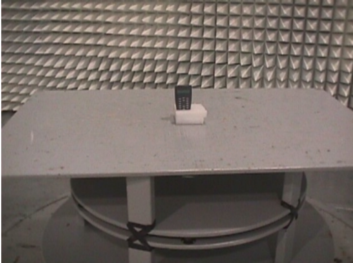
Radiated Emissions Test Configuration