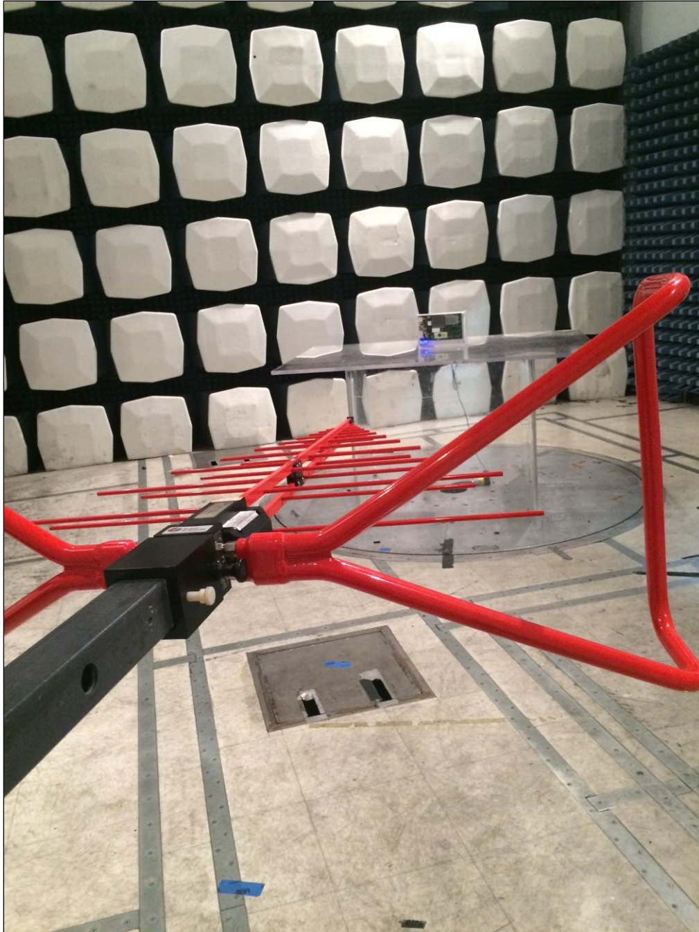
Photograph 1. Radiated Spurious Emissions, Below 1 GHz, Test Setup