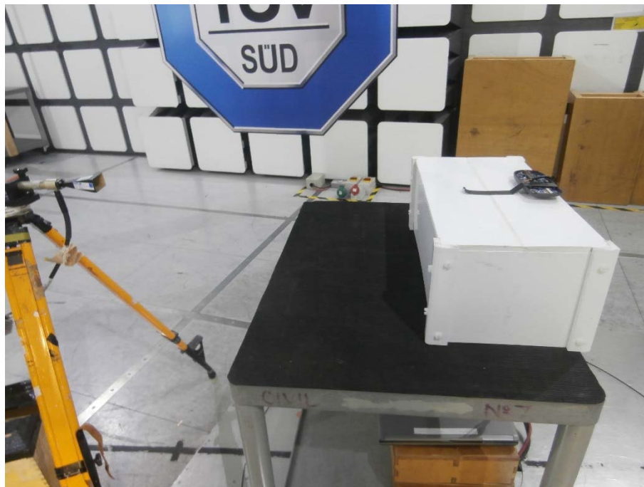
Radiated Emissions 18 GHz to 25 GHz