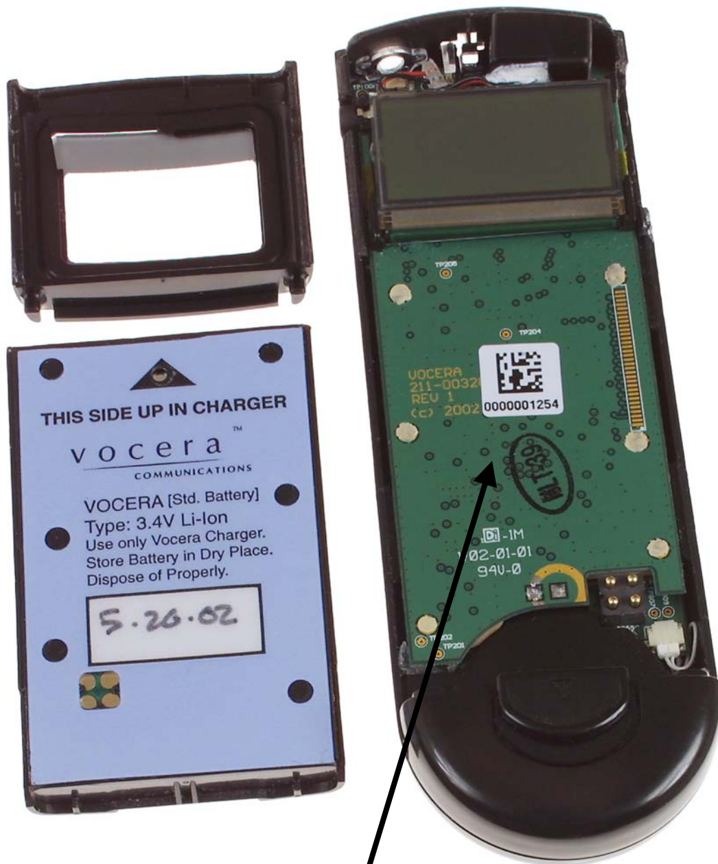
FCC ID LOCATION