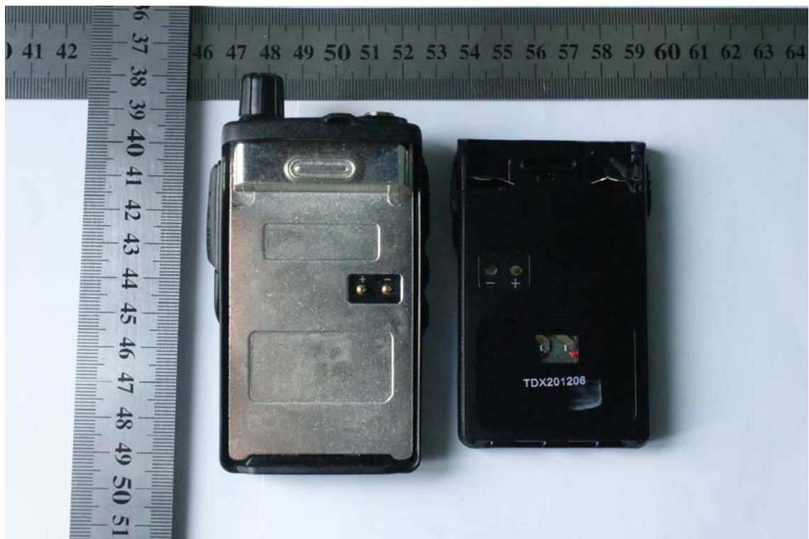
INTERNAL PHOTO OF SAMPLE-1