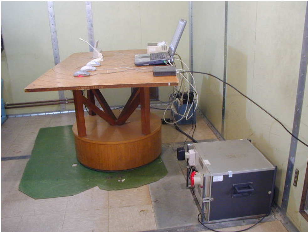
LINE CONDUCTED SETUP PHOTOGRAPH - REAR VIEW