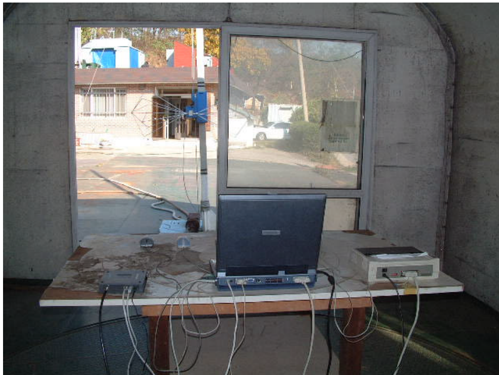
RADIATED EMISSION SETUP PHOTOGRAPH - REAR VIEW ( 30 - 300 MHz )