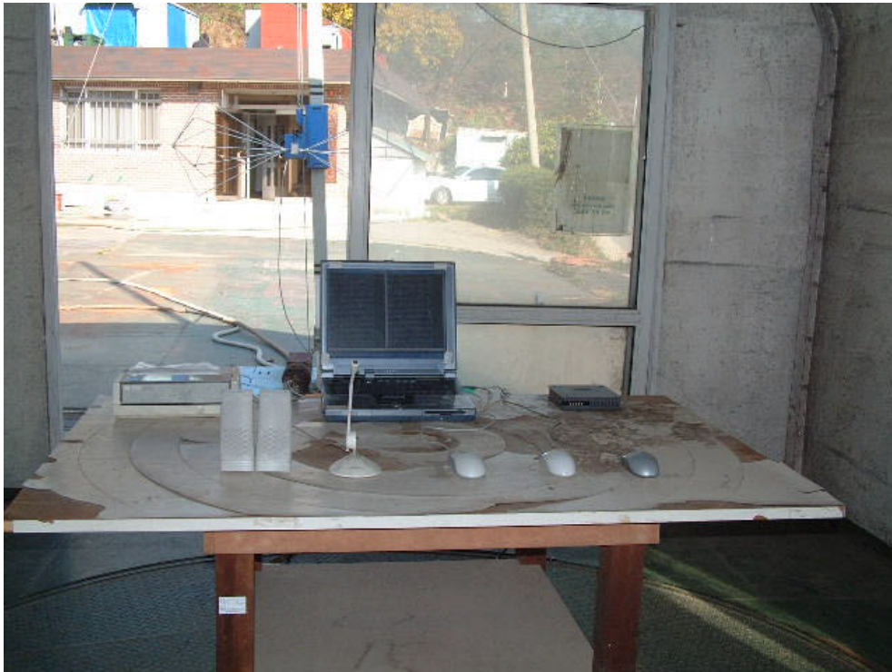
RADIATED EMISSION SETUP PHOTOGRAPH - FRONT VIEW ( 30 - 300 MHz )