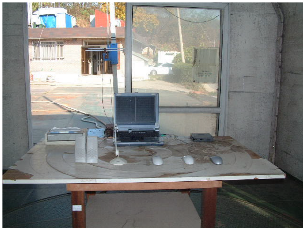
RADIATED EMISSION SETUP PHOTOGRAPH - FRONT VIEW ( 300- 1000 MHz )