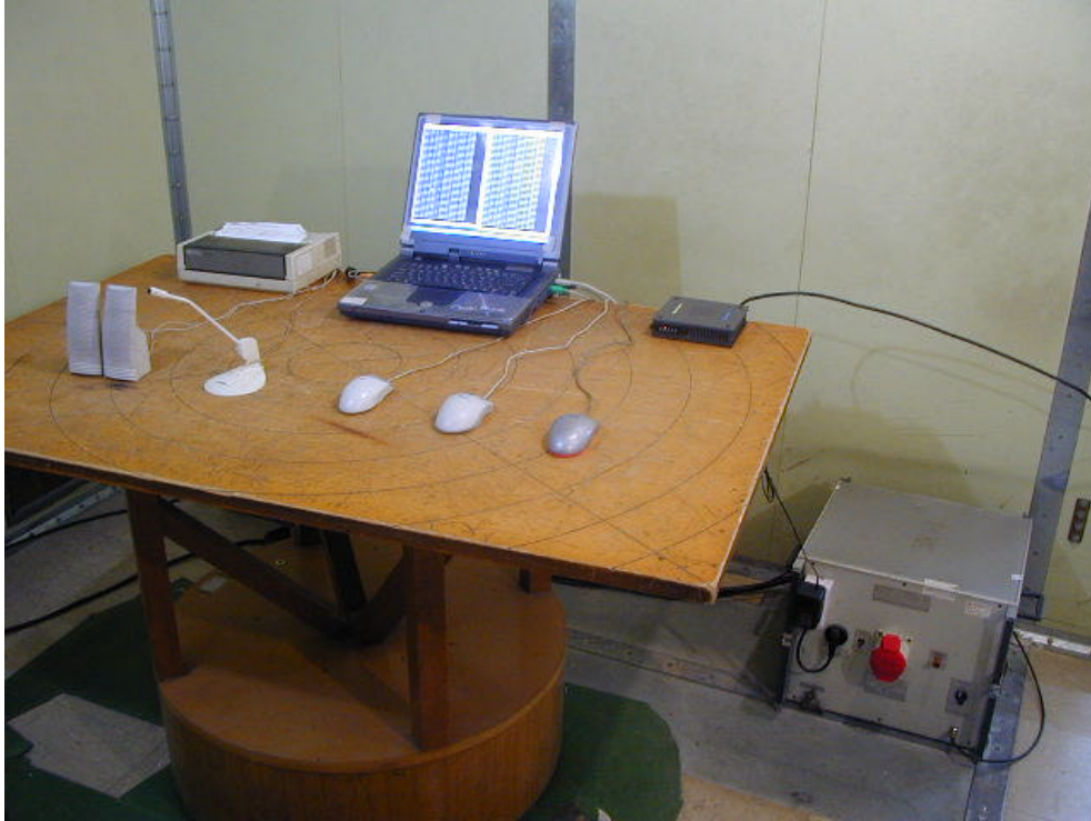
LINE CONDUCTED SETUP PHOTOGRAPH - FRONT VIEW