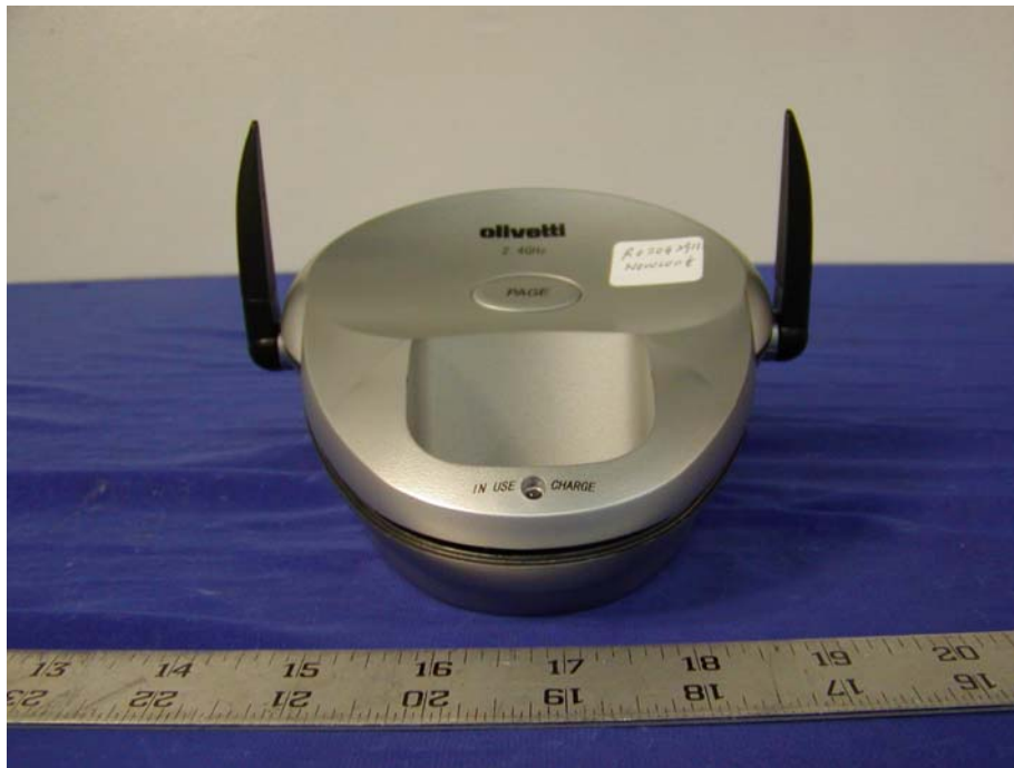
Power Adapter - Overall View