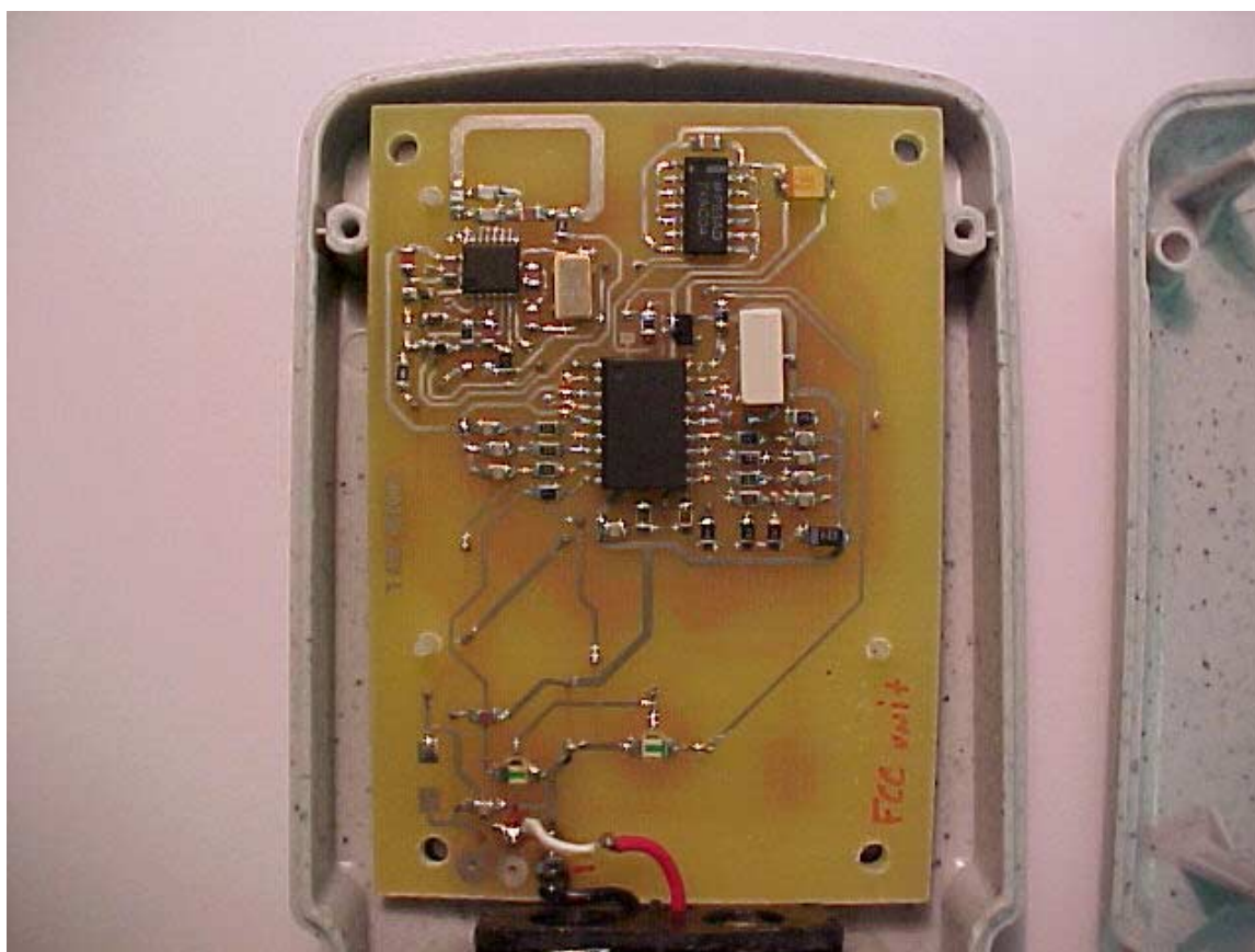
Component Side of PCB with Antenna Upper Left Corner of PCB