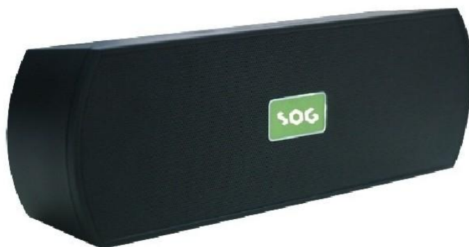
Item: W-02 Bluetooth Speaker