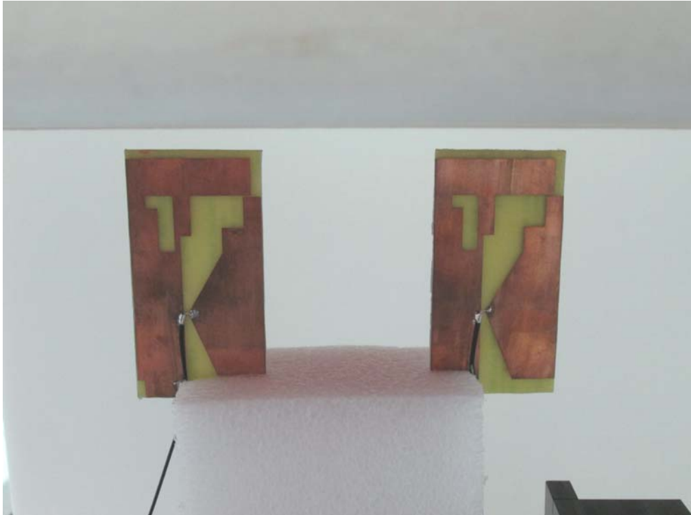
Bottom, Test Separation 5 mm