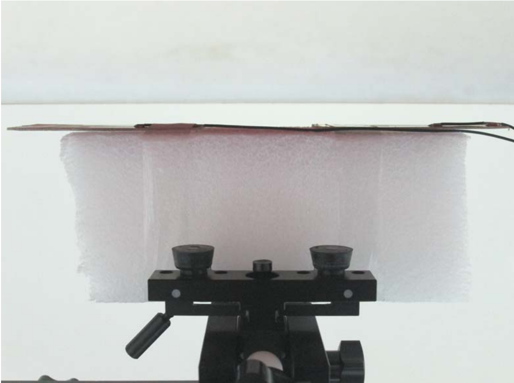
Back, Test Separation 5 mm