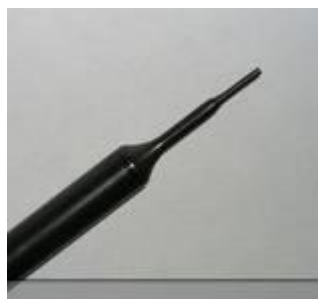
Interior of probe

Application: High precision dosimetric measurements in any exposure scenario (e.g., very strong gradient fields). Only probe which enables compliance testing for frequencies up to 6 GHz with precision of better 30%.