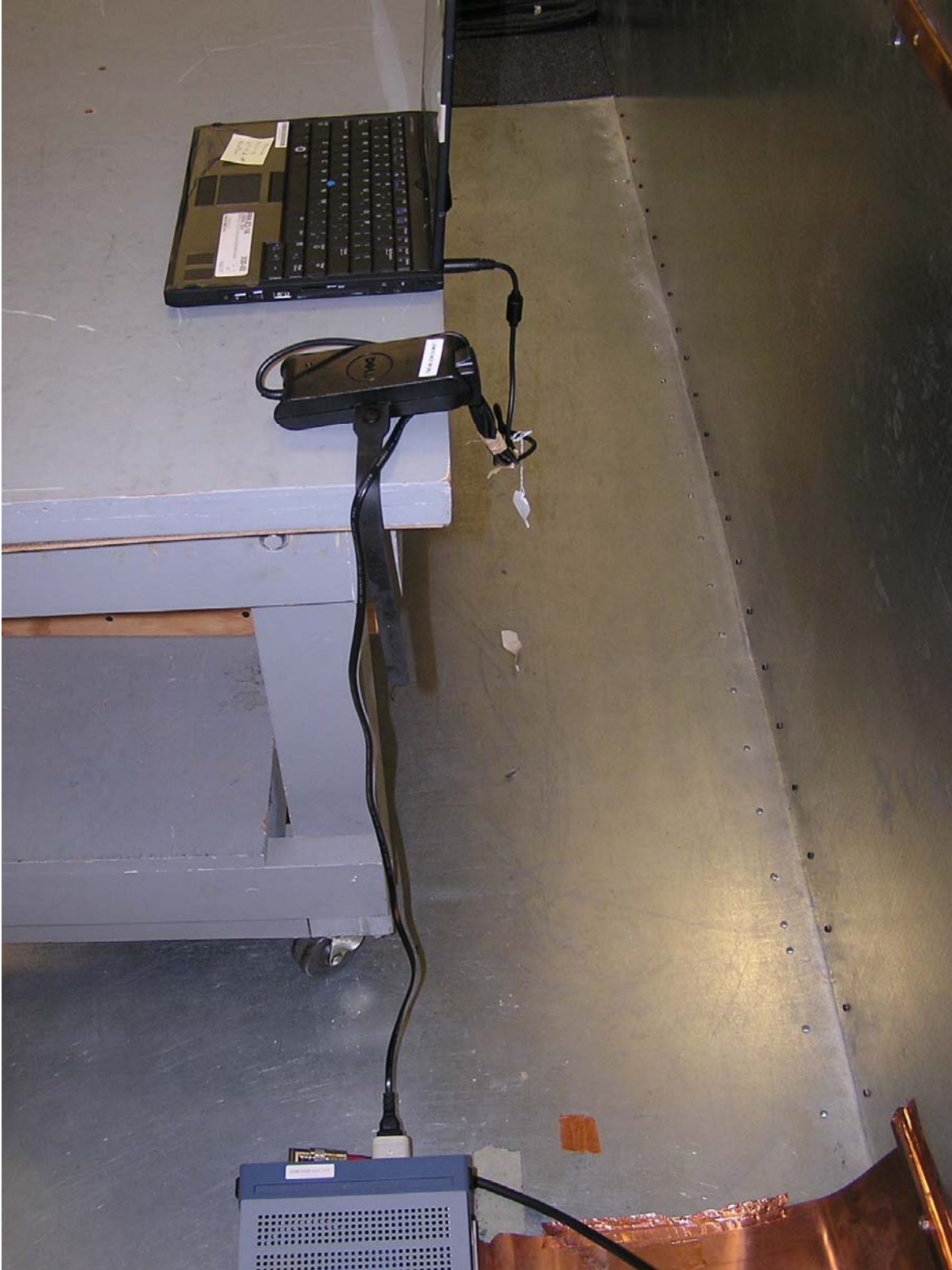
MODULE INSTALLED INSIDE THE HOST LAPTOP