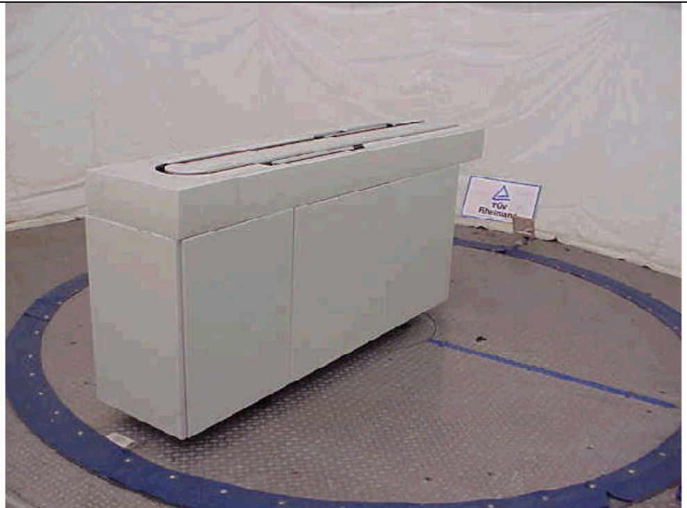
Conducted Emissions (free standing - Test configuration #1)