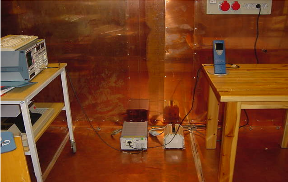
Conducted disturbance voltage in the frequency range 0,45 - 30 MHz