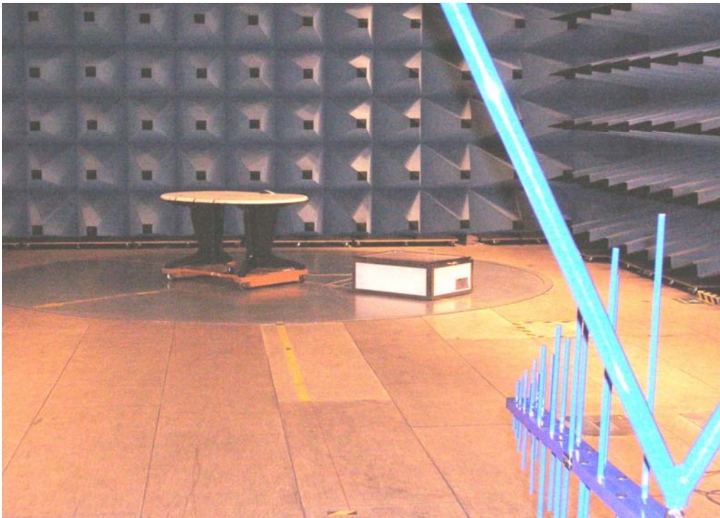
Radiated spurious emissions (30 - 1000 MHz)