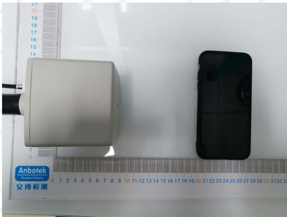
Photo of MPE Measurement