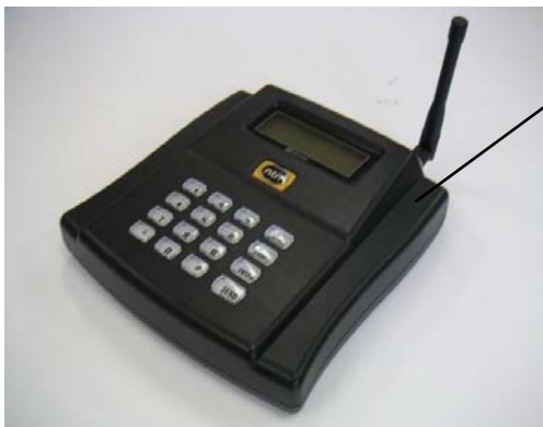
LTK-1400AH Transmitter Front Case