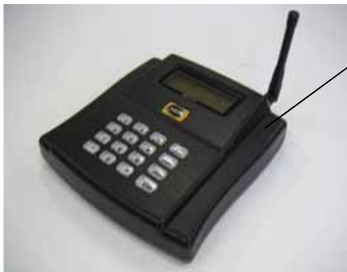
LTK-1100L Transmitter Front Case