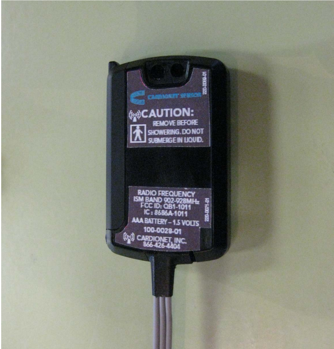
LABEL LOCATION (ILLUSTRATION PURPOSES ONLY)