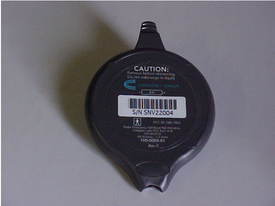
SENSOR LABEL LOCATION