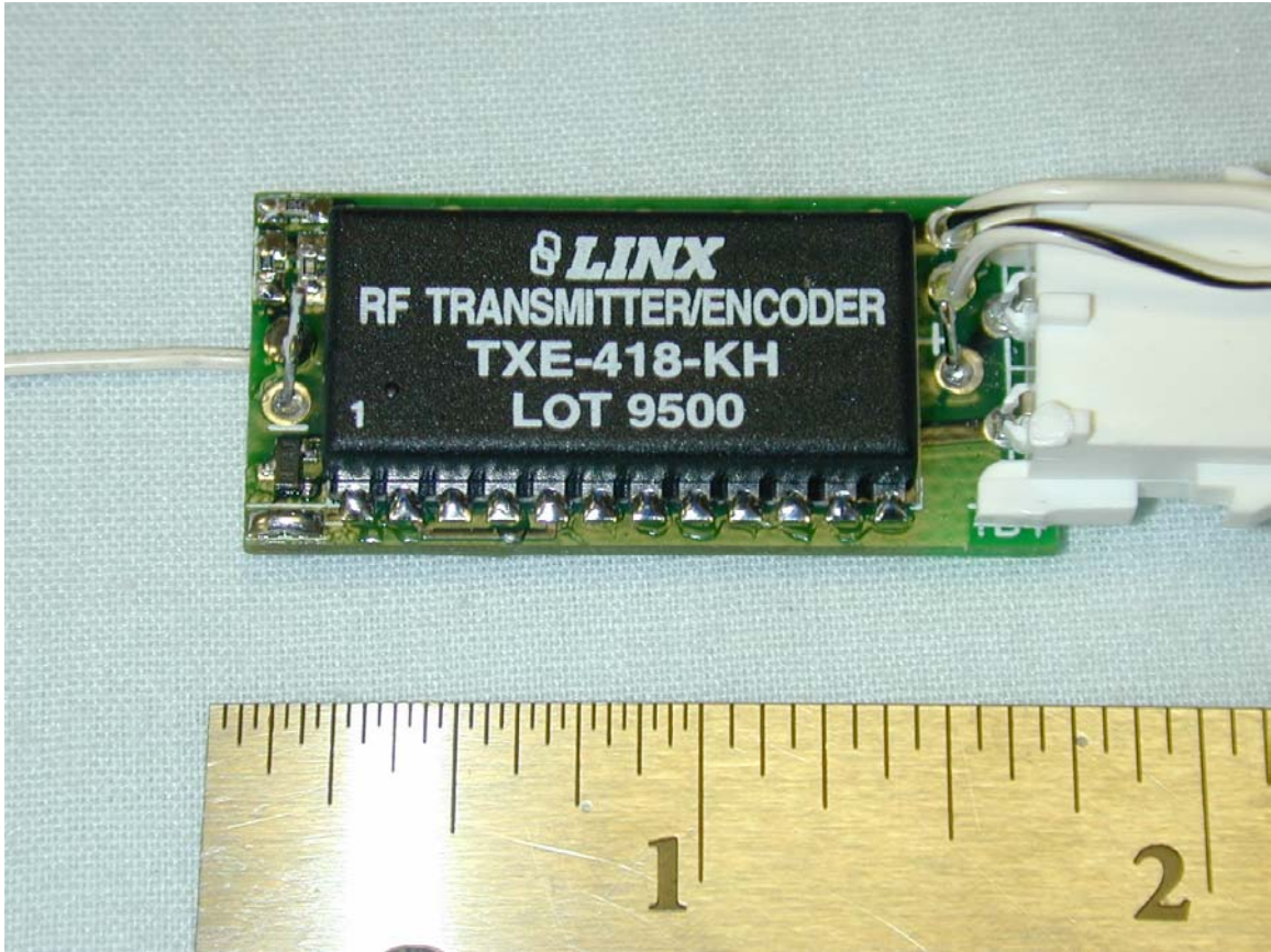
Photo 1 - Top of PWB with battery removed