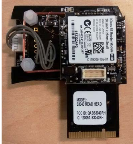
FCC / IC label

Label location on the module (on the pcb )