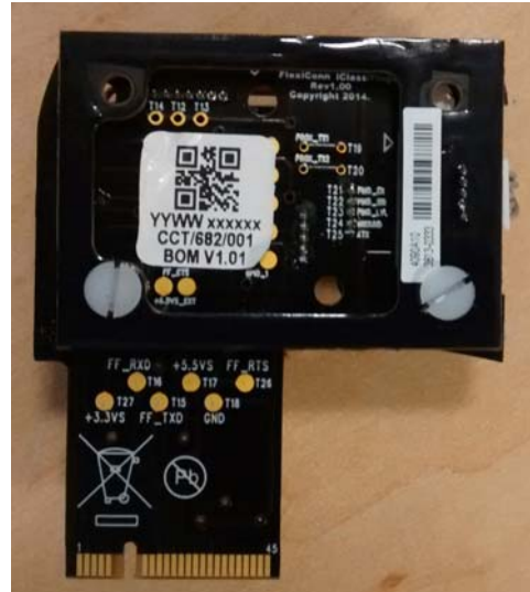
Product / Manufacture label