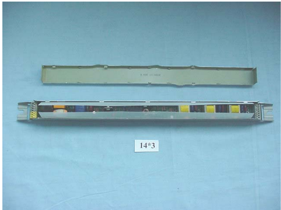
FIGURE 1 BALLAST (M/N: FBT T5 14x3) COVER REMOVED