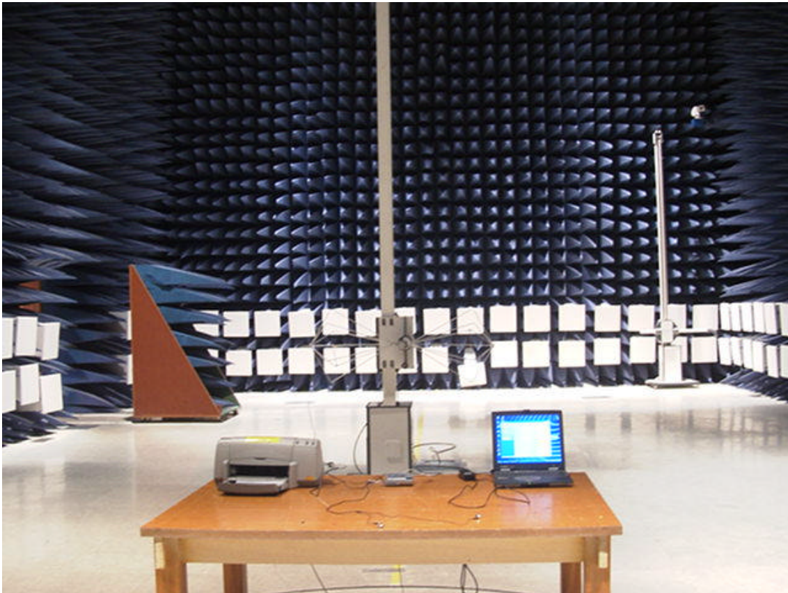
<DISTURBANCE RADIATION >