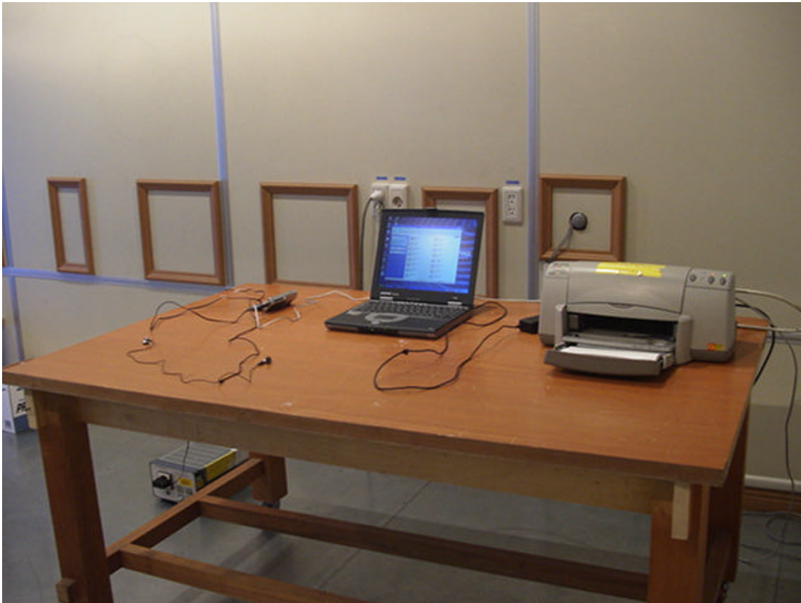
<CONDUCTED DUSTURBANCE VOLTAGE >