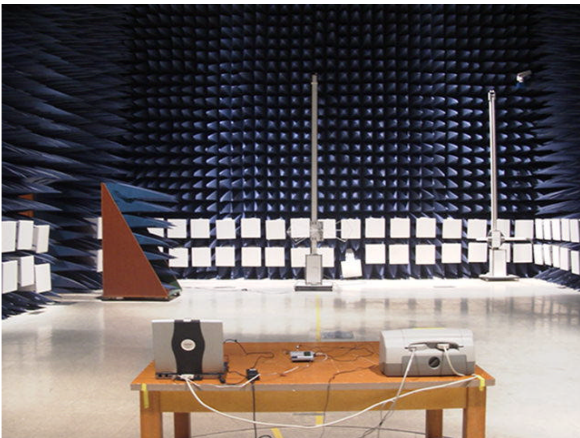
<DISTURBANCE RADIATION >