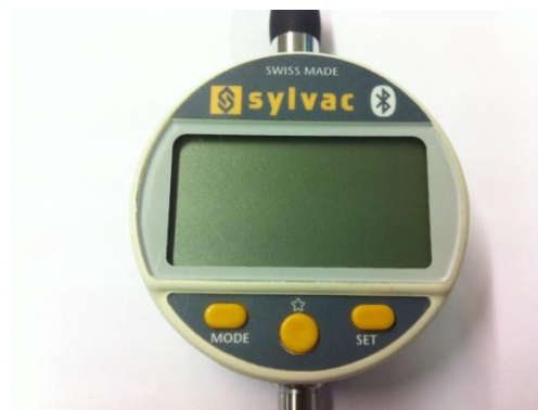
Figure 4 - Sylvac version