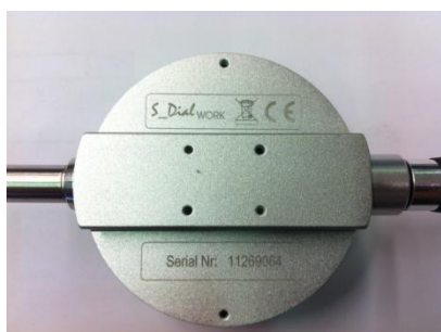
Figure 1 - Old Sylvac version