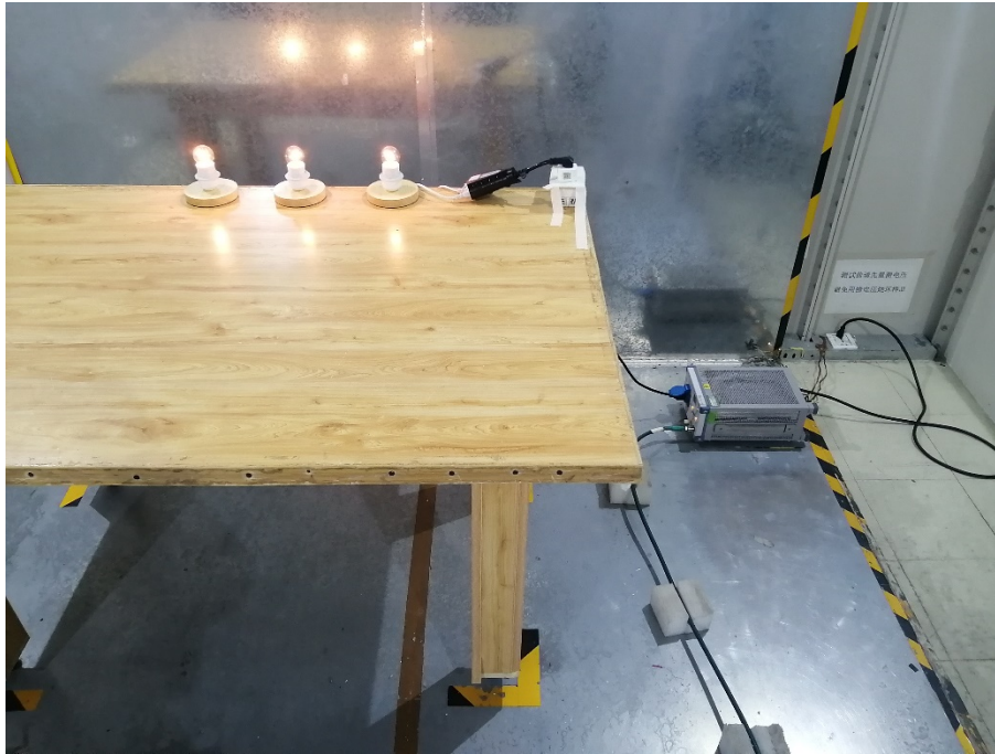
Conducted Emissions (Left View)