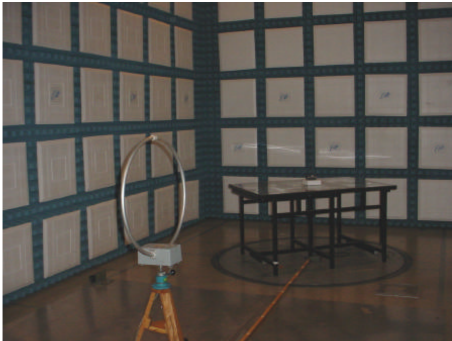
TEST SETUP FOR RADIATED EMISSIONS MEASUREMENTS MAXIMIZED FOR MEASUREMENT OF WORST CASE EMISSIONS