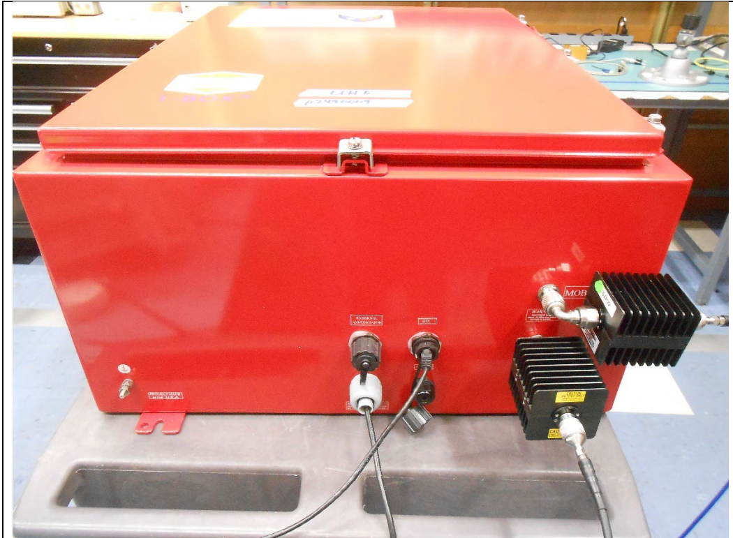
RF Conducted #2