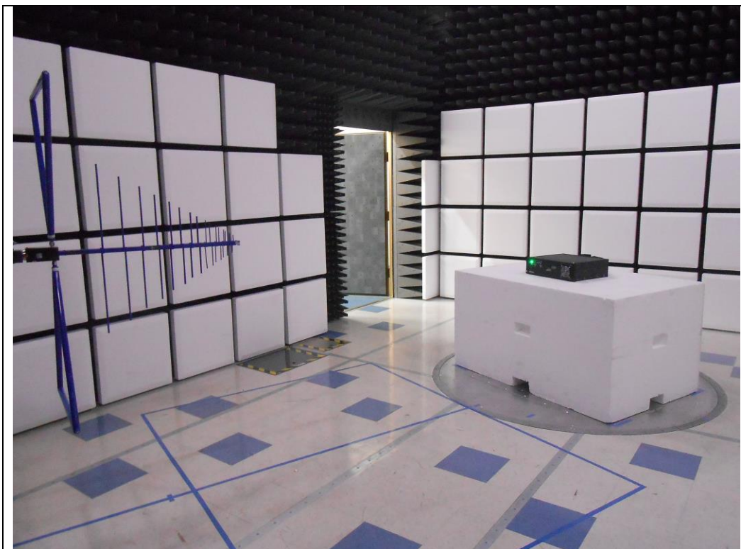
RF Radiated (testing above 1GHz)