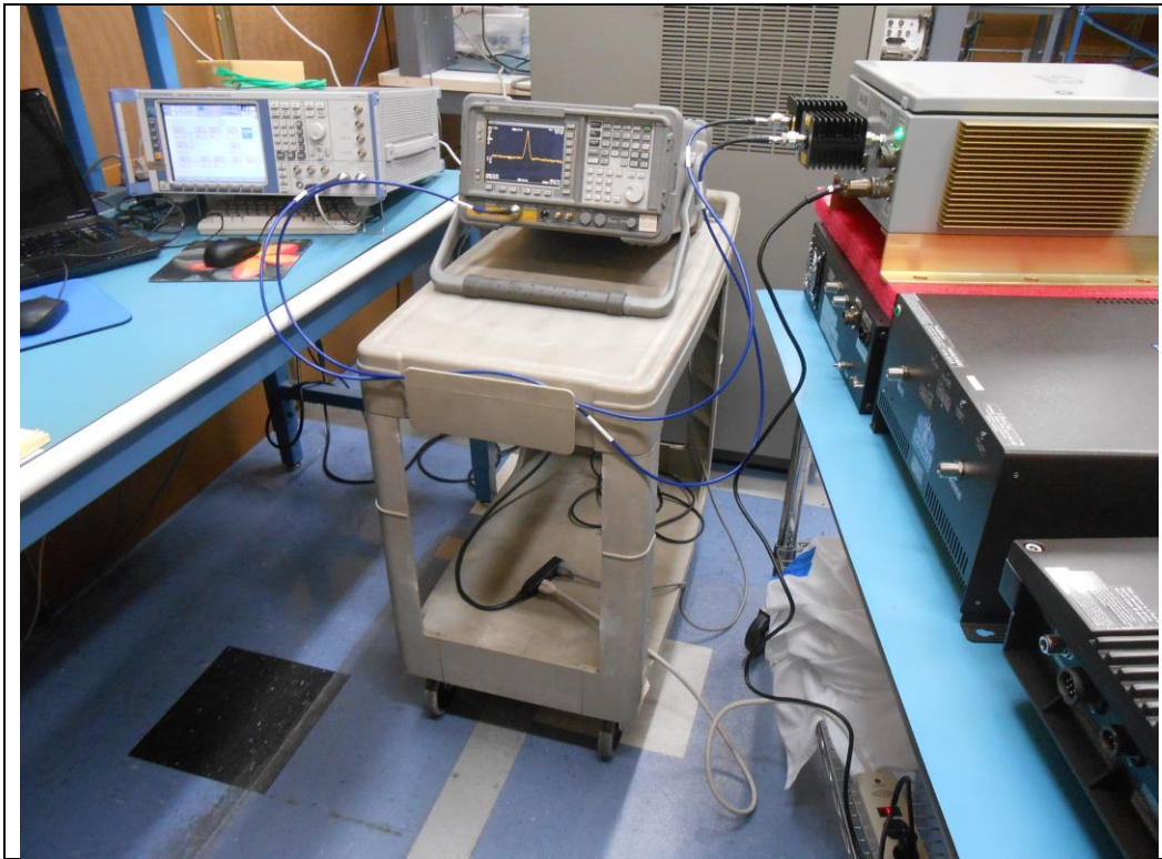
RF Conducted #2