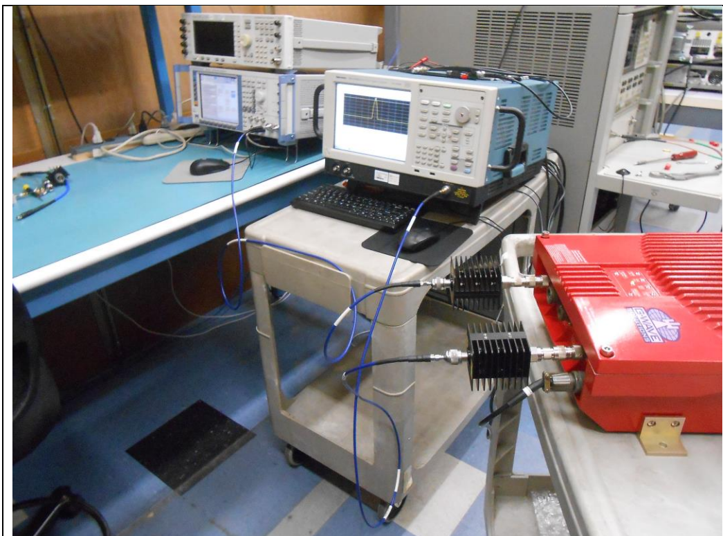
RF Conducted #2