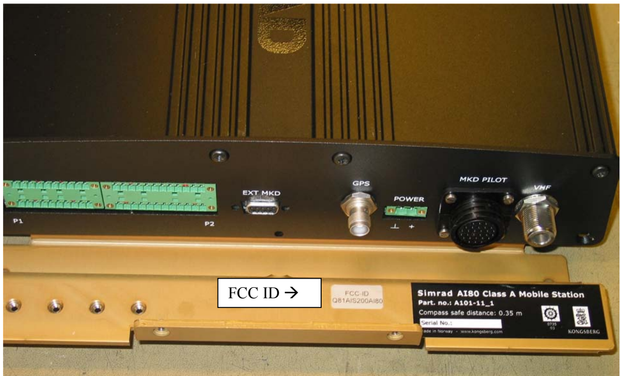
Figure 2 FCC ID label on bottom plate - rear

On the AIS 200/Simrad AI 80 mobile unit, labels will be located on two places located at rear part of the cabinet. One set of labels is placed on the extension of the bottom plate of the unit to the left of the main product label (figure 2), and the second set is placed on the rear cover (figure 3). The rear cover is removable as shown on the pictures below and when the cover is removed the other labels will be visible.