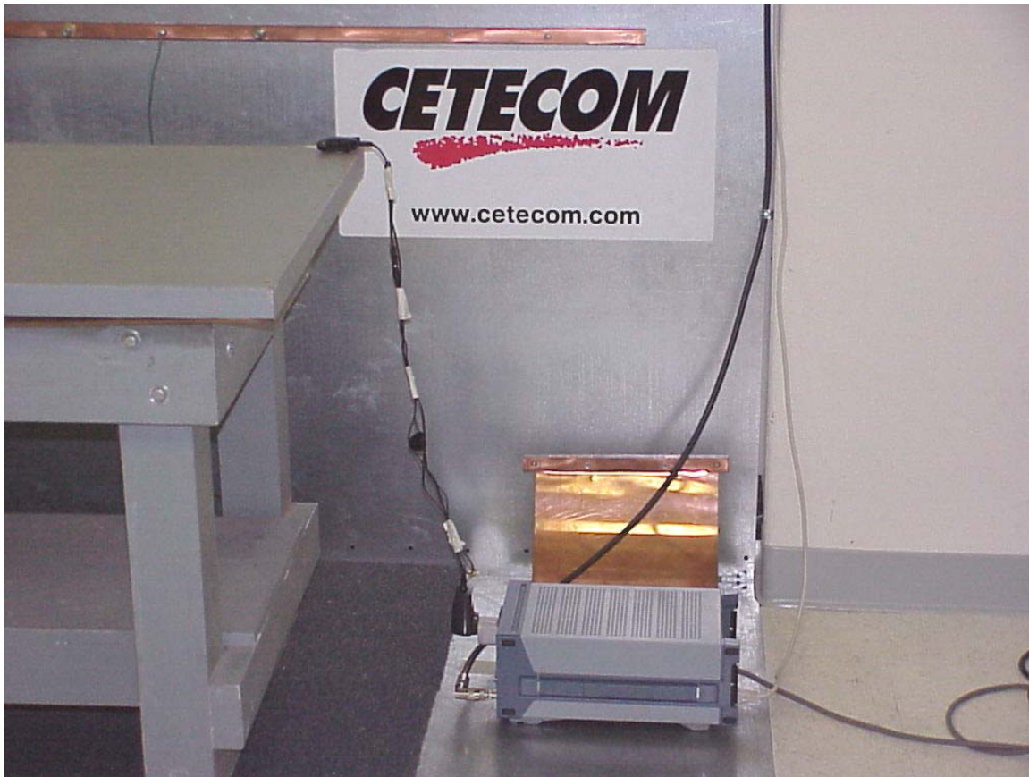
Test setup – AC line conducted emissions