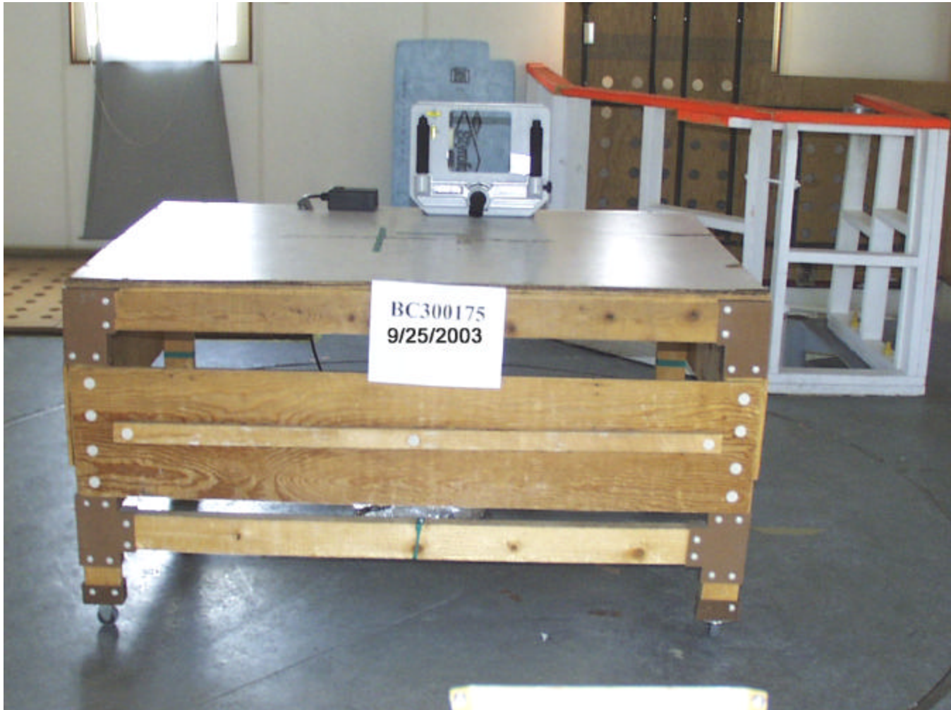
Test-setup photo(s): Radiated Emissions