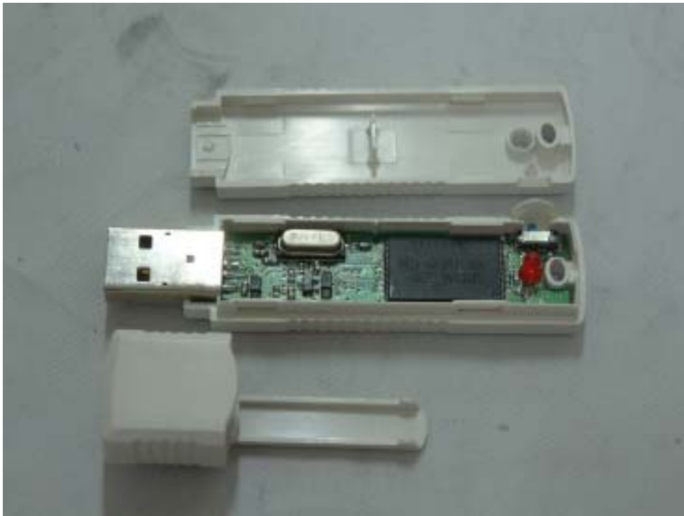
<INTERNAL VIEW OF E.U.T>