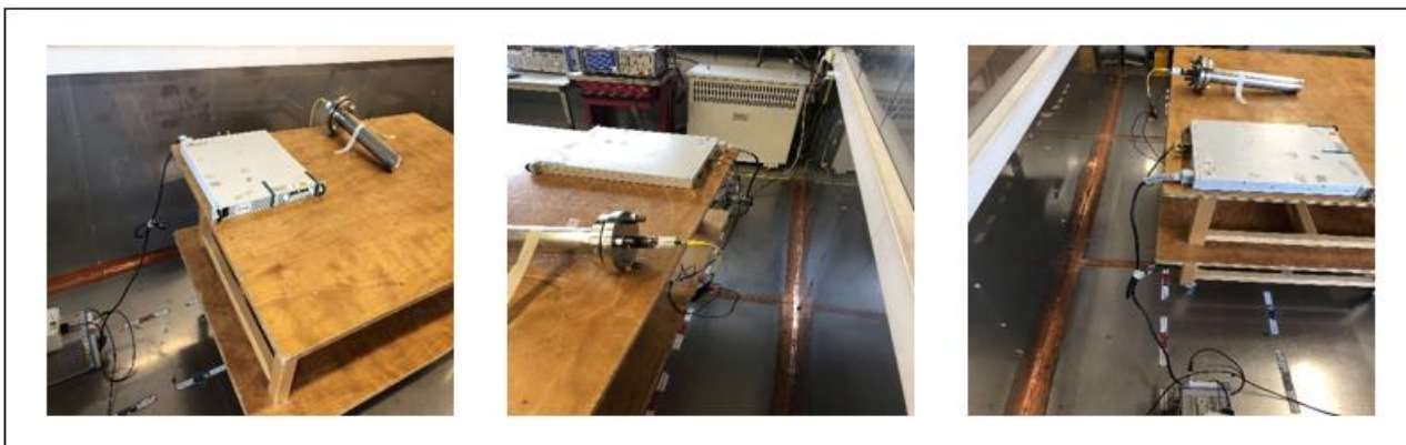
Photograph for AC Power Line Conducted Emissions (Front view)