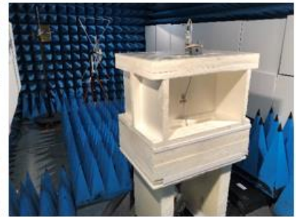
Test setup in Axis Z (worst case position):

Photograph for Unwanted Emission in restricted frequency bands