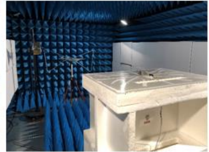
Test setup in Axis XY (worst case position):