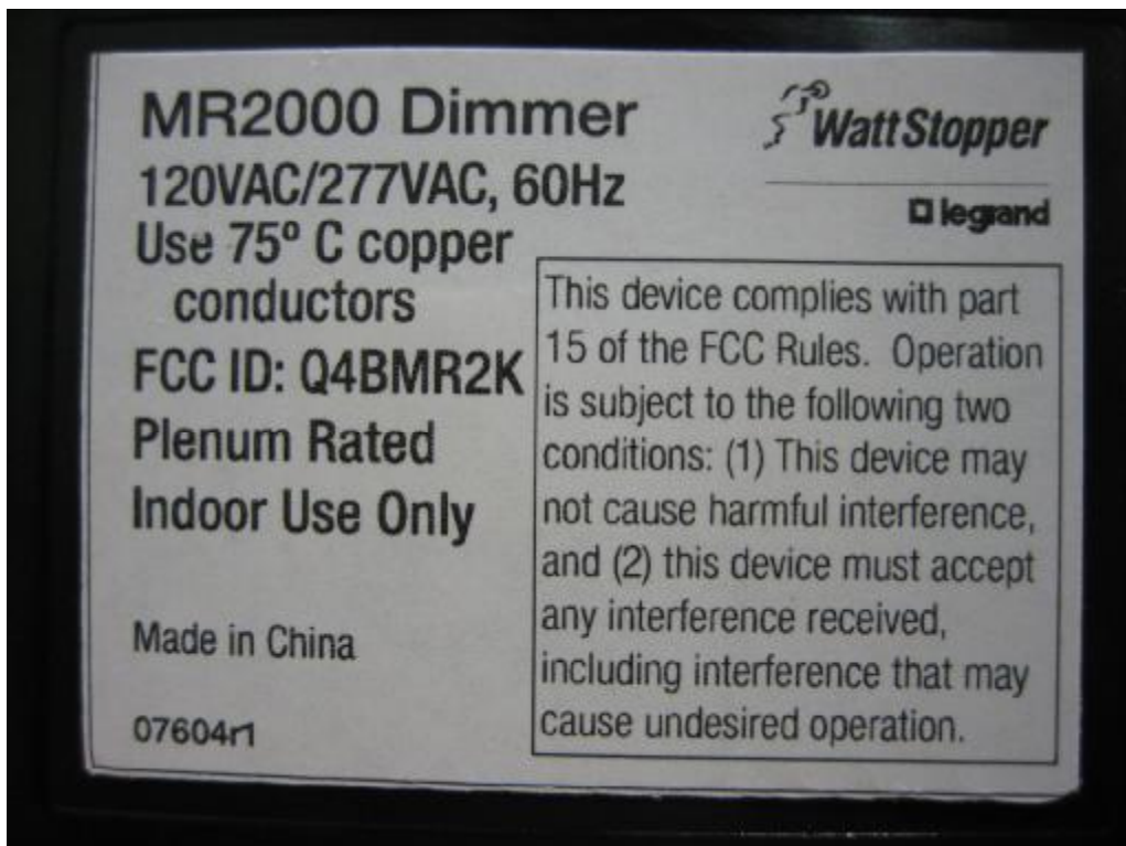
Zoom into Label