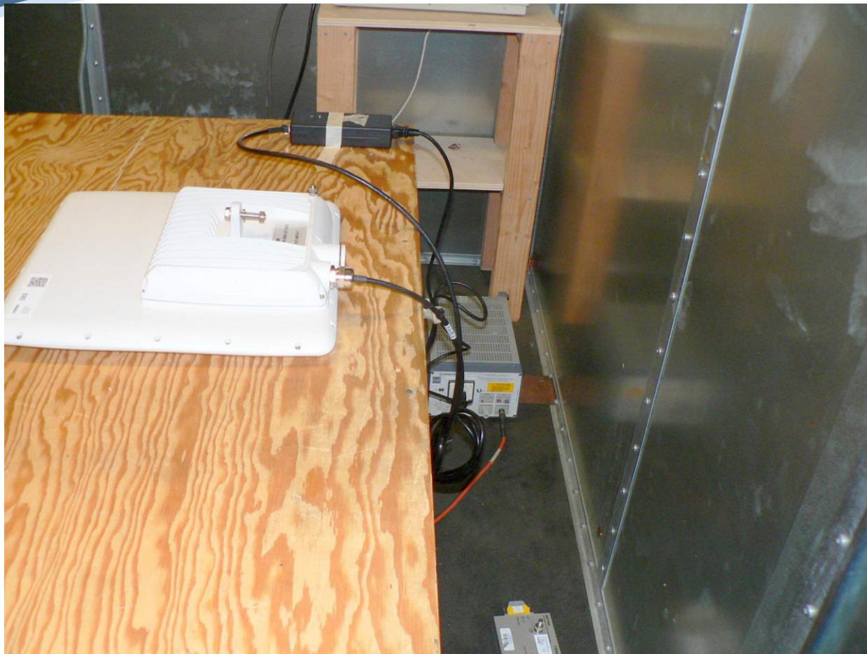
RDWN64 AC Mains Conducted Side