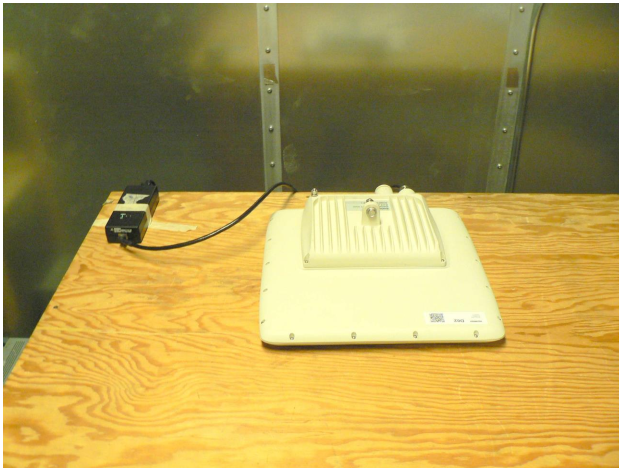
RDWN64 AC Mains Conducted Front