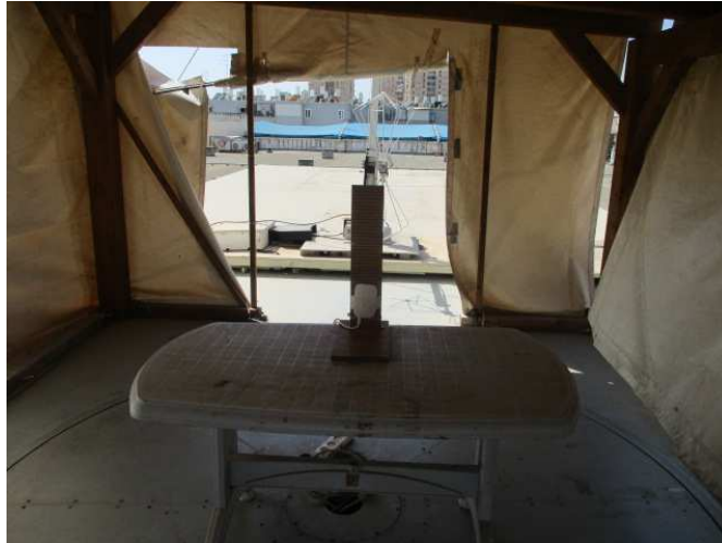
Figure 3. Radiated Emission Test, 30.0-200.0MHz