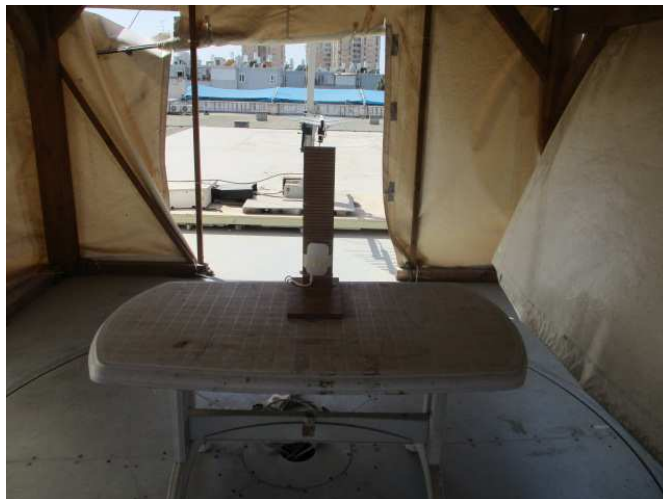
Figure 4. Radiated Emission Test, 200.0-1000.0MHz