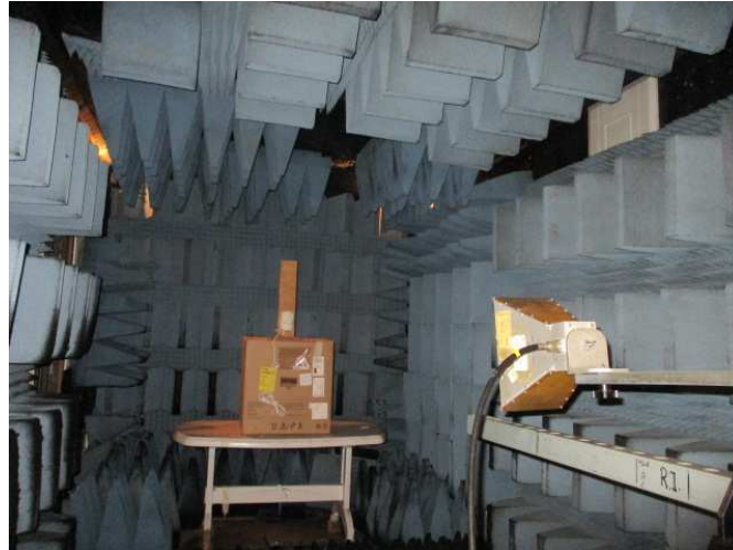
Figure 5. Radiated Emission Test, 1.0-18.0GHz