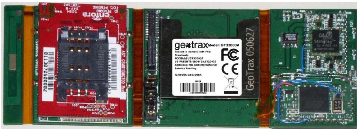
Figure 4.2a. External/Internal Photo Top (with labeling)

Figure 4.2a shows the indicated region for FCC Labeling along with the internal photo of the top of the EUT. Figure 4.2b is a blow-up of the FCC product label and Figure 4.2c is the internal photo of the bottom of the EUT.