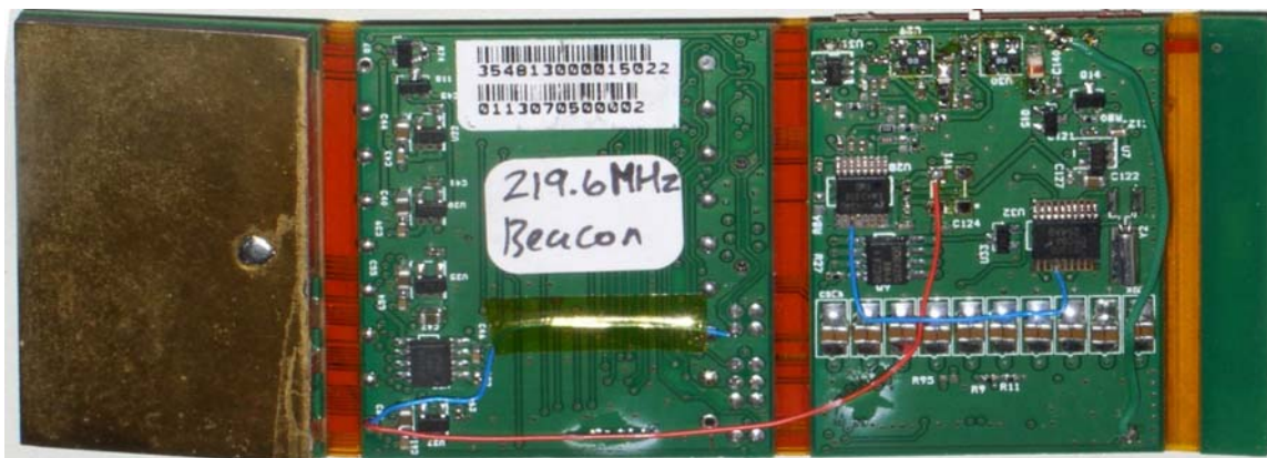
Figure 4.2c. External/Internal Photo Bottom